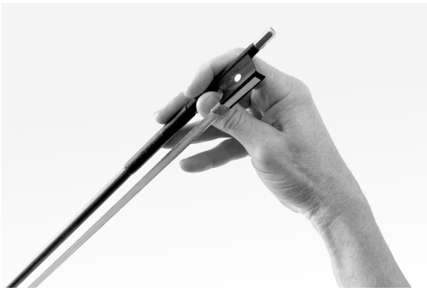
(Photo 7) Right hand position Note the wrist is fairly straight and in a Naturally comfortable position.