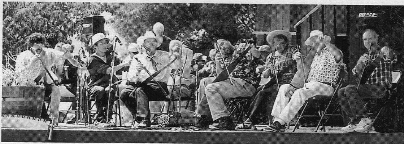
Some of the Saw Players Massed on the Main Stage at the Saw Festival in 2000

Bring YOUR festive mood out to Roaring Camp in the small town of Felton, which is about 15-20 minutes north of Santa Cruz - where the REAL fun begins! We have been given permission to meet in the outer parking lot at Roaring Camp to have an informal pot-luck dinner and jam session - which generally lasts from about 6-10 PM and