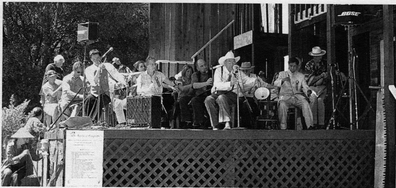
Some of the 28 saw players visible at the 2003 "Massing of the Saws."