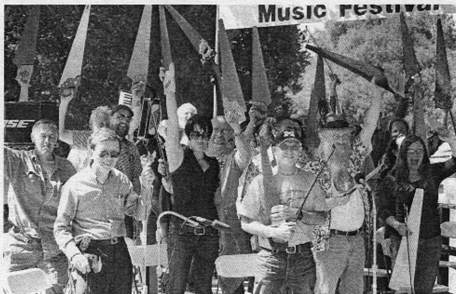
Part of the 2008 Chorus of the Saws.